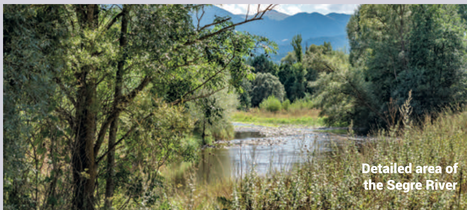
Detailed area of the Segre River

At first sight, the place where Ger town is located is not really special. It is not up in a hill, nor next to a lake, and it does not have any river nearby. However, if we pay close attention to the site, we can see that it is a natural border between the fields at the bottom of the valley and the mountains at the top. It might seem that this is not a strategic area, but it is indeed , because it allows farmers to grow crops in these flat fields and, at the same time, it avoids living at the steep slopes of the mountain. Houses are arranged in different rows in order to prevent some of them from shading the others. That is why we can discover the different forest paths which go down to the village . We can also follow the river footpath which connects the whole region. It is in our town that the riverbank suddenly goes to the other side and embraces the Segre River .