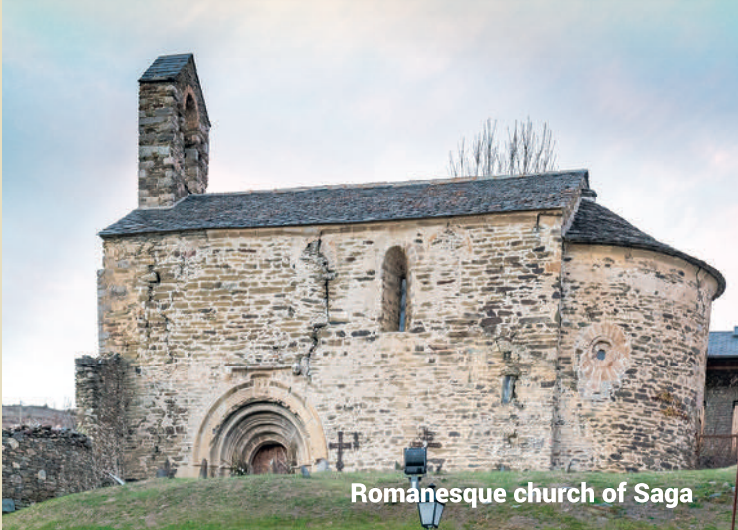
Romanesque church of Saga

In spring or in summer, tourists have the chance to visit us and enjoy our festival events, such as the one in Saga, which takes place in mid-May; or the festival in Gréixer, which occurs at the beginning of June. The biggest festival event is in Ger. It is known as the Patron Saint Festival of Roser de Ger. It takes place in September, and it lasts for four days in order to say goodbye to the festive season.