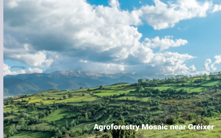
Agroforestry Mosaic near Gréixer

Feixa shelter is a perfect base camp in order to reach Puigpedrós. After spending the night there, we need to start the excursion early in the morning. This itinerary goes through the pine forest, which is plenty of snow-roses or alpine roses in July. Once the forest is over, we can see Mal Lake and from this point onwards, it is plenty of chamois and rock ptarmigans. All this area is included in the nature reserve called Natura 2000 Tossa Plana-Puigpedrós .